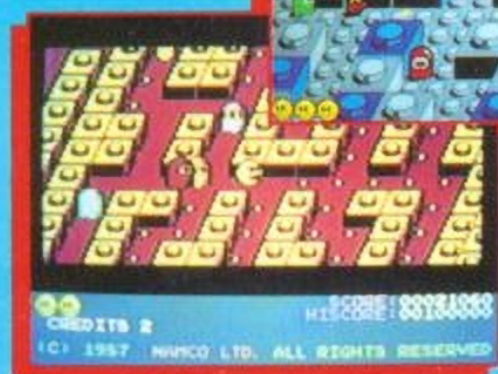
C64 screen shot