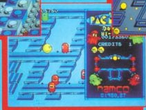
Ataria ST screen shot