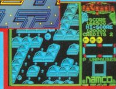
Amstrad screen shot